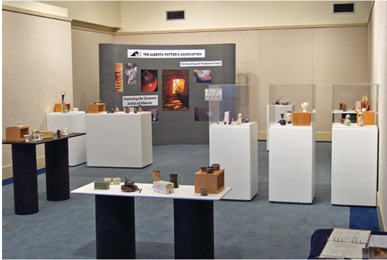
2006 AGM at Red Deer College and Cone Box show

proposal to scale back the fees, activities and newsletter and get back to “grass roots” managing. They introduce saving costs by using the internet to provide information. Rely on and encourage regional APA activities, gather together at the AGM’s. To cut back on burnout, rotate the executive and region every two years.