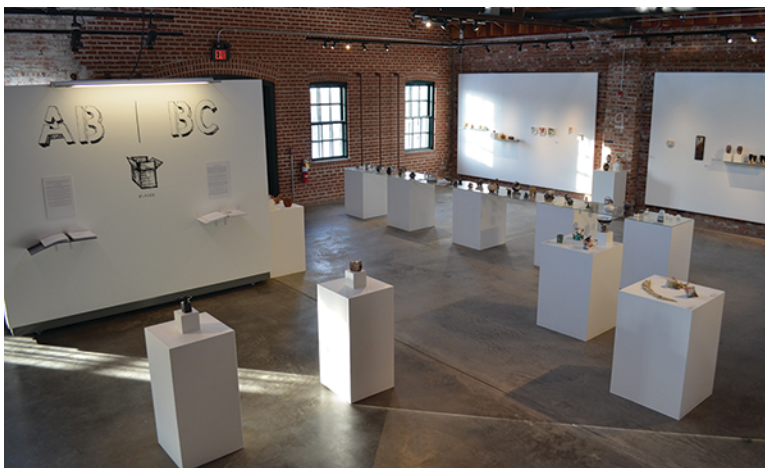
2007 AB/BC Show held at Medalta, Comox and Vancouver

Heritage Centre and around the Province until 2010.